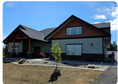
Administrative & Medical Facilities