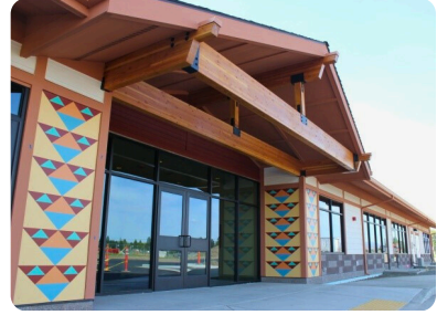
Tribal & Cultural