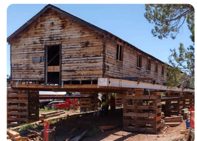
Historic Renovation & Restoration