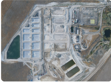
Fish Infiltration, Hatcheries & Fishways