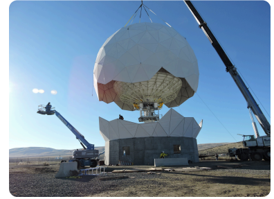
SCIFs and Towers