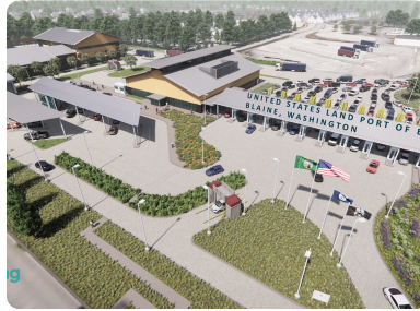
Land Port of Entry & Secure Sites