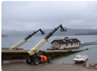
Breakwater, Docks & Marinas