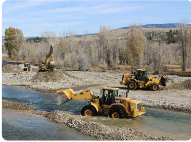
Road & Bank Stabilization