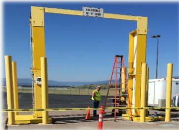
Radioactive Portal Monitors