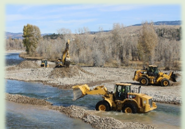
Road & Bank Stabilization