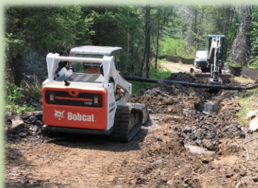
Remote Site Waterline