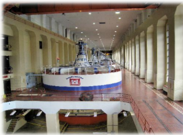
Control Rm Fire Protection