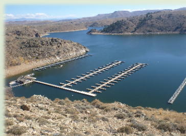
Marina Dock Replacement