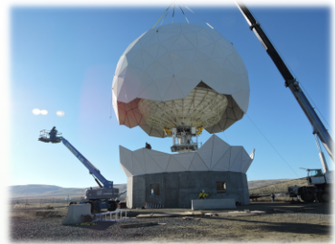
SCIFs and Towers