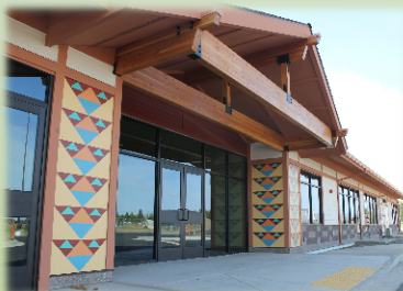
10,000sf New Construction