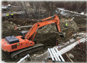
Fish Infiltration Gallery