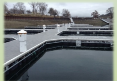
Replace Docks & Slips