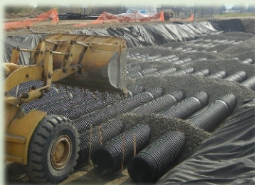
Parking Lot & Infiltration Gallery